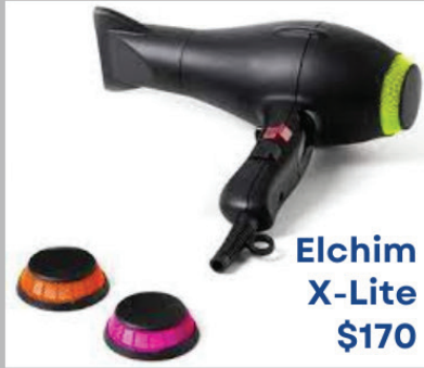
Elchim X-Lite $170