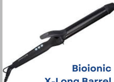
Bioionic X-Long Barrel 1" or 1 1/4" - $90