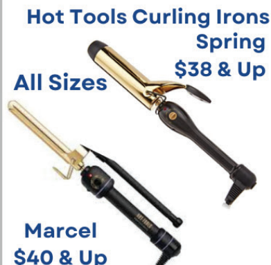
Hot Tools Curling Irons Spring $38 & Up All Sizes Marcel $40 & Up