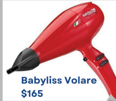
Babyliss Volare $165