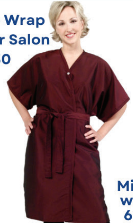
Kimono Wrap W/ Your Salon Logo $30