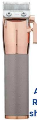
Babyliss FX Clipper $200

Available in Rose Gold as shown, Black or Gold