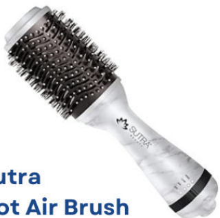
Sutra Hot Air Brush 2" and 3" $50