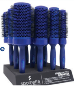
Spornette XL Barrel Display $175