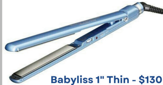
Babyliss 1" Thin - $130