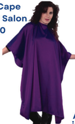
Dream Cape W/Your Salon Logo $30