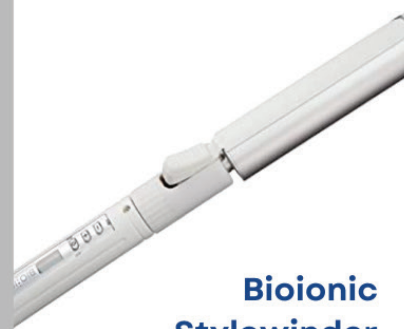
Bioionic Stylewinder 1" or 1 1/4" - $95