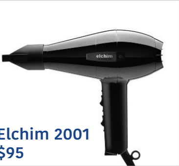
Elchim 2001 $95