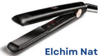
Elchim Natures Touch $140