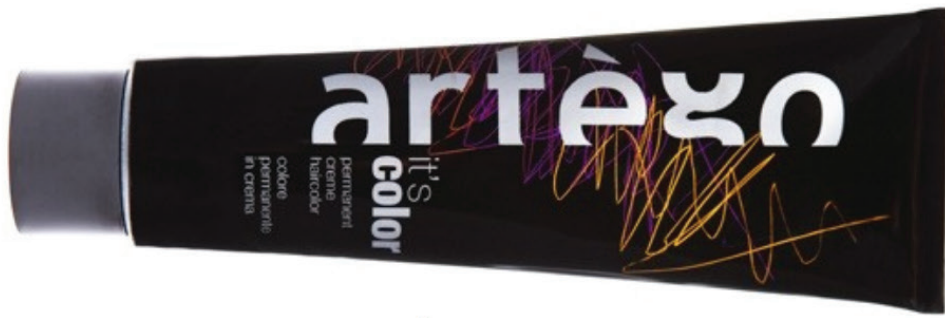
5.1 oz. Tube for as low as $7.50 - Made in Italy