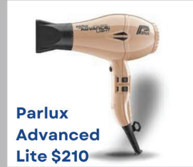
Parlux Advanced Lite $210