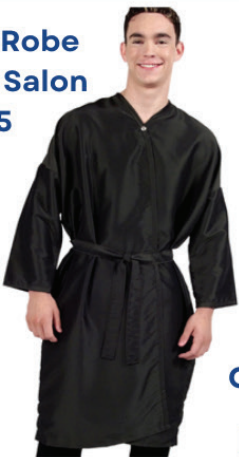
Kimono Robe W/Your Salon Logo $35